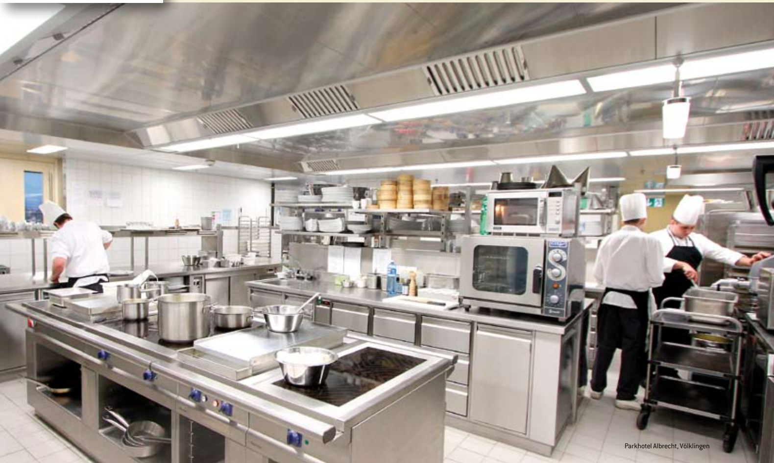
Parkhotel Albrecht, Völklingen