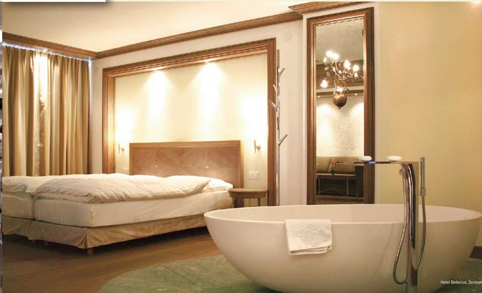
Hotel Bellevue, Zermatt