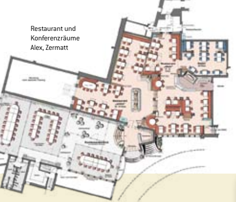
Restaurant und Konferenzräume Alex, Zermatt